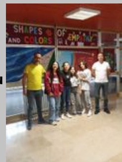
TURKISH TEAM Sule Muzaffer Buyuk Mesleki ve Teknik Anadolu Lisesi