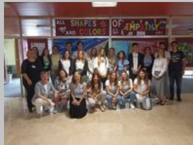
CROATIAN TEAM Gimnazija "Matija Mesić"