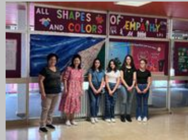
NORTH MACEDONIAN TEAM Opštinsko Osnovno Učilište Dimkata Angelov Gaberot s. Vatasha