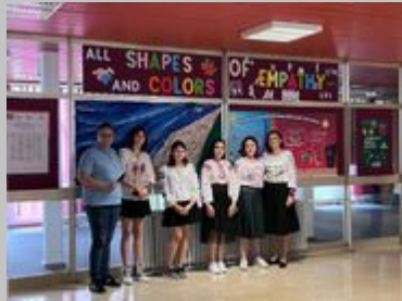
ROMANIAN TEAM Liceul Tehnologic Economic "Virgil Madgearu" Iasi